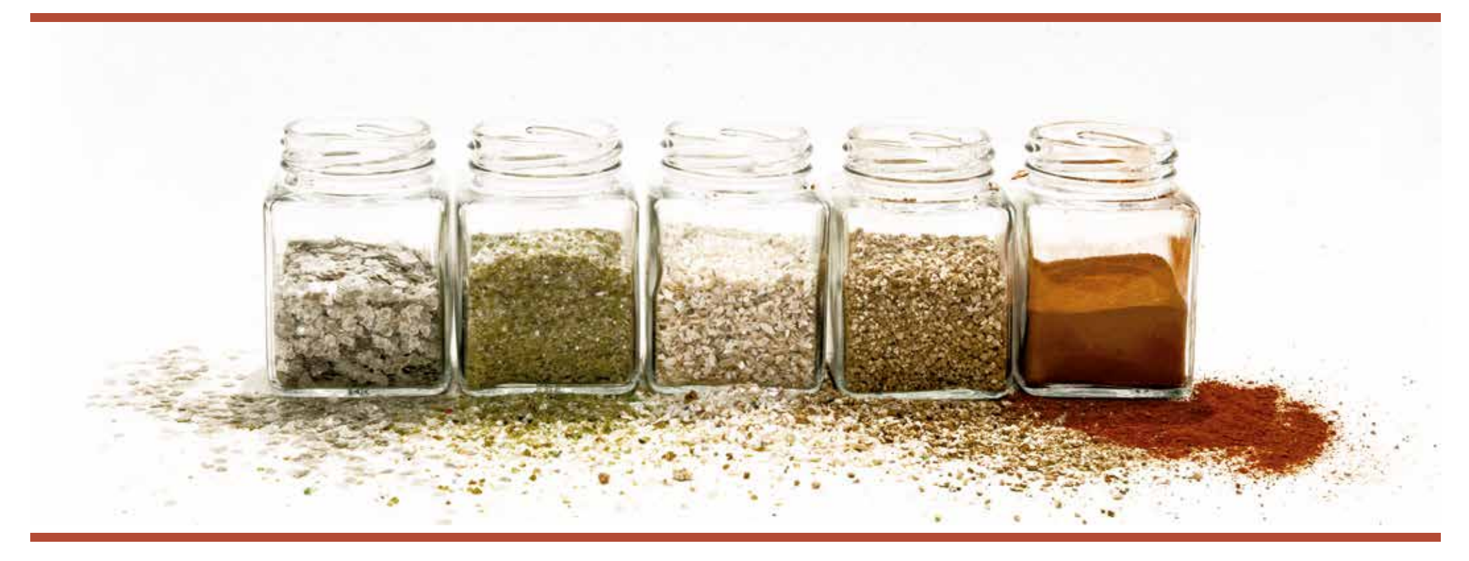
MICA / VETRO / CONCHIGLIE / PIETRA PREZIOSA / COCCIOPESTO